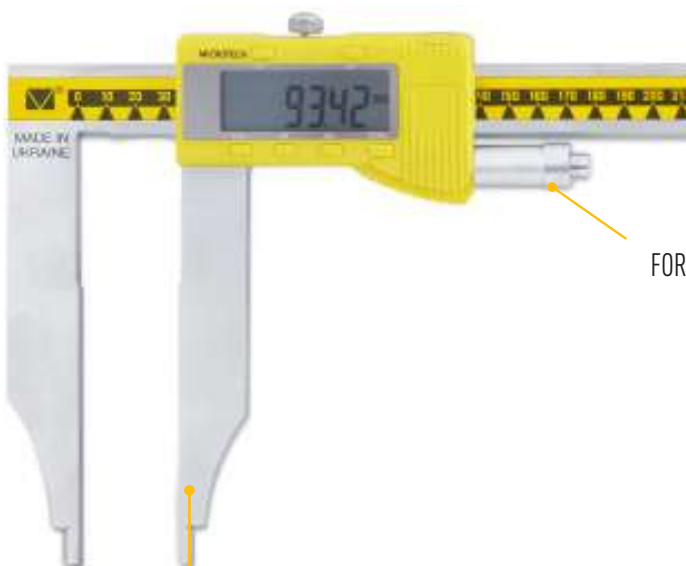
FORCE control module 8N