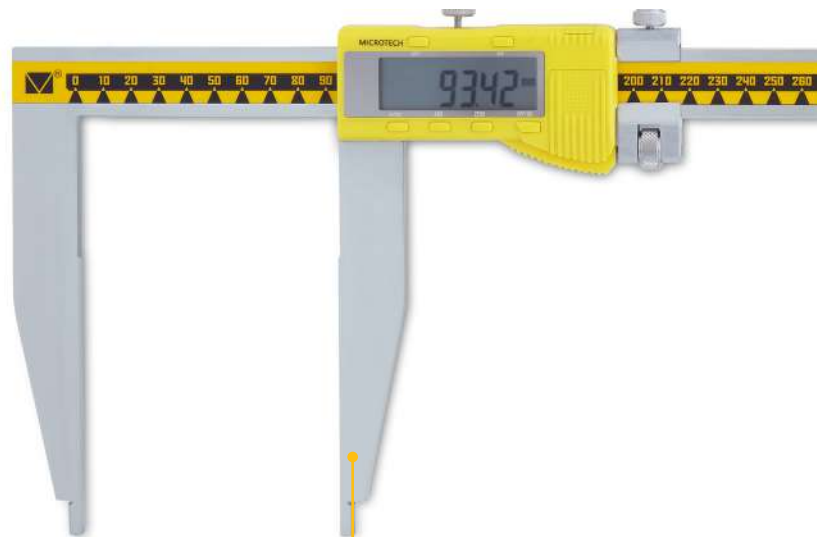
Hand finished measuring jaws