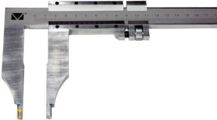
Hand finished measuring jaws