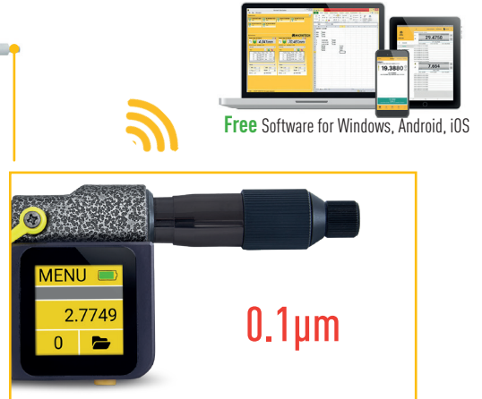
Computerized micrometer head