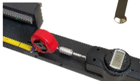
FORCE GAUGE FOR TENSILE LOAD 50N