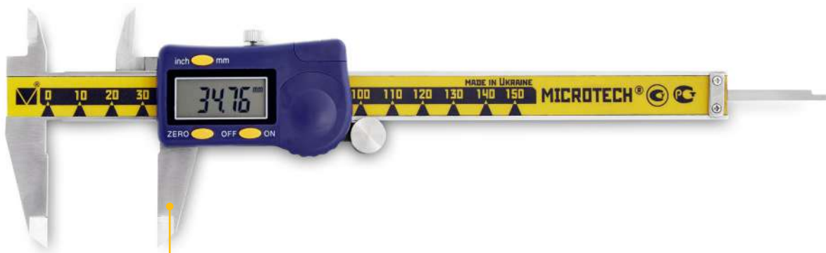
Hand finished measuring jaws