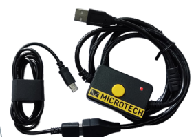
141083000 USB HID DATA TRANSFER CABLE 2.5M DIRECT DATA TRANSFER, LIKE A KEYBOARD