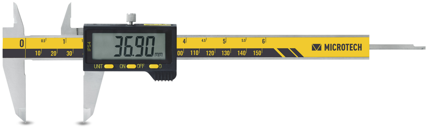
MODIFICATION THUMB ROLLER