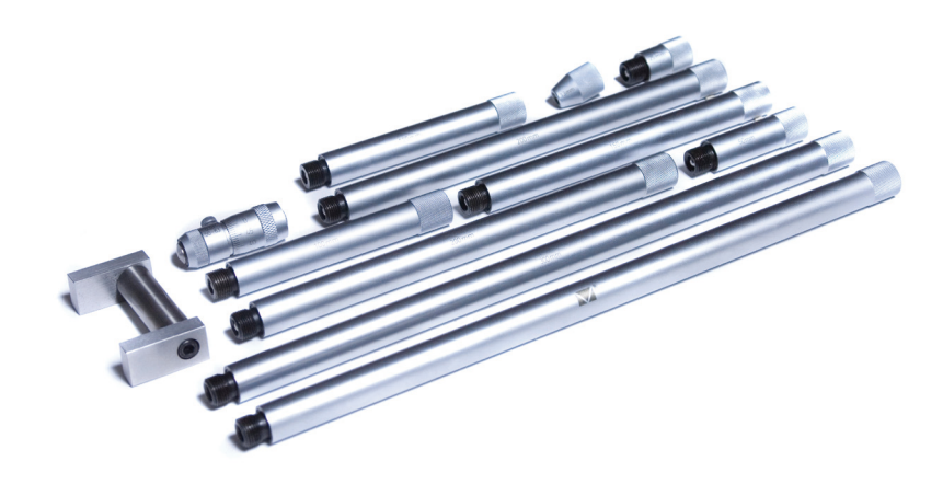
* design of 600mm version