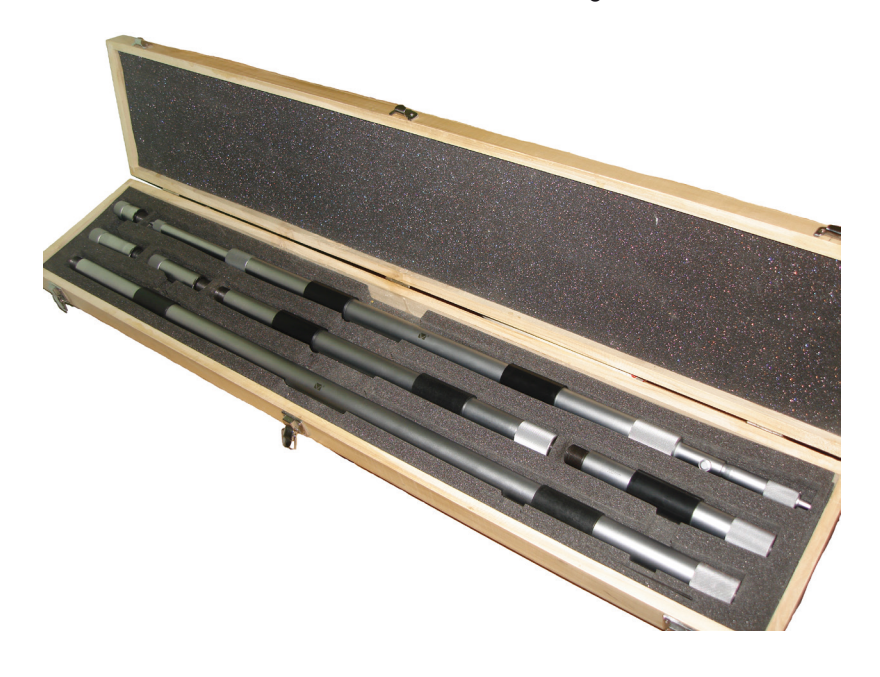
* design of 2000mm version