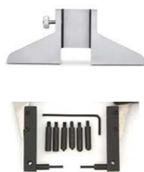
ACCESORIES SET'S AND DEPTH BASES