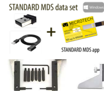
ACCESORIES SET'S AND DEPTH BASES