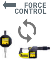
MEASURING HUB MICROTECH DEVICES CONNECT